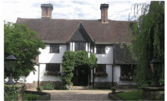
The locally listed Priors Corner on Barnet Lane

Selection Principles: Landmark Qualities, Intactness, Aesthetic Merits