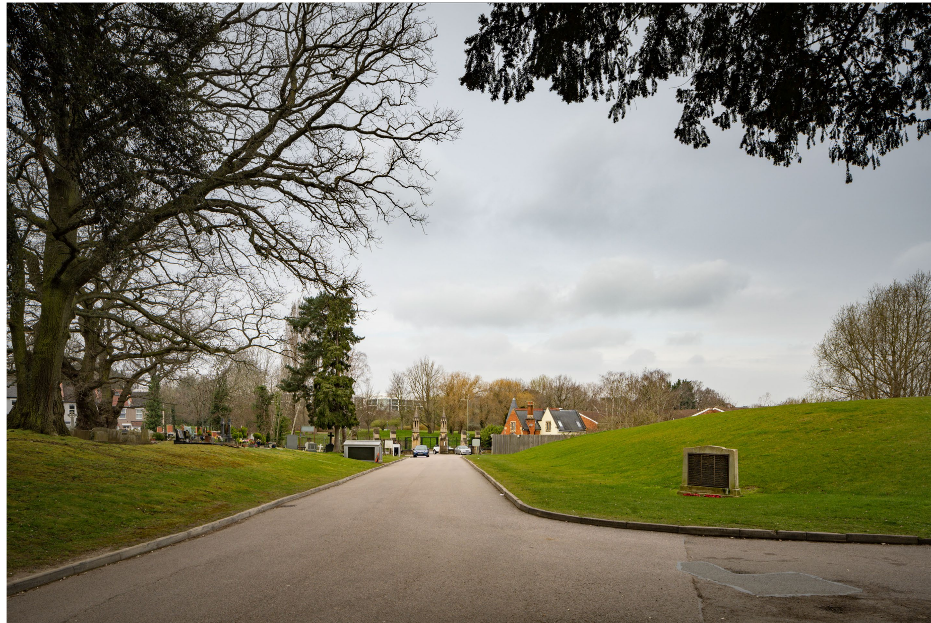
View 7: New Southgate Cemetery, looking towards entrance gateway