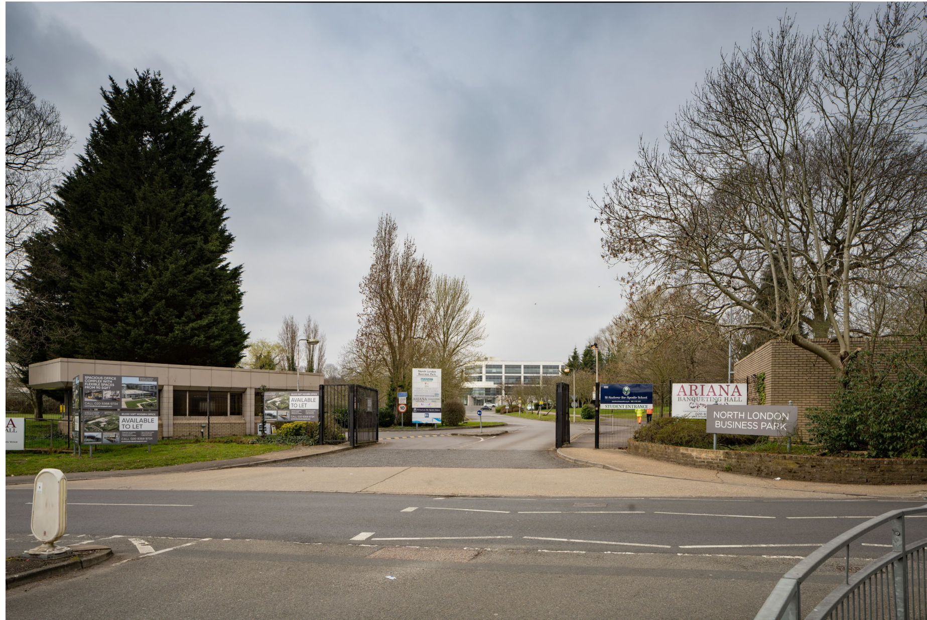
View 9: Brunswick Park Road, looking along site entrance