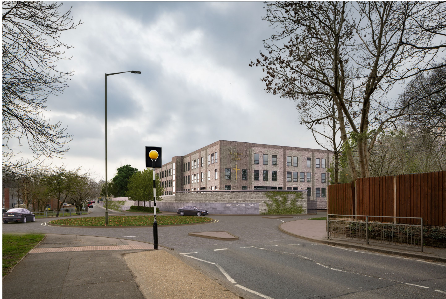
View 10: Brunswick Park Road north