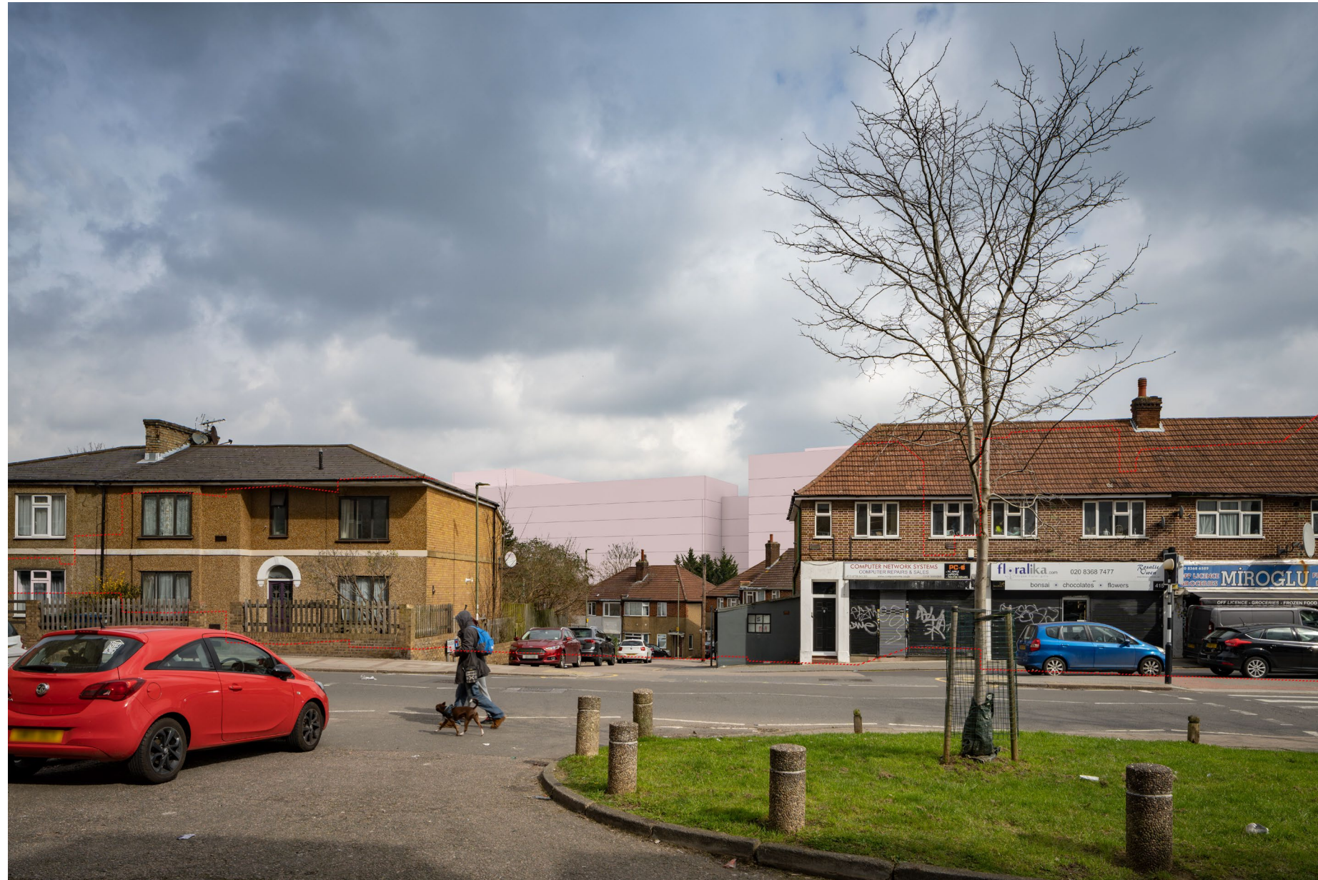
View 18: Oakleigh Road north, looking along Oakleigh Crescent