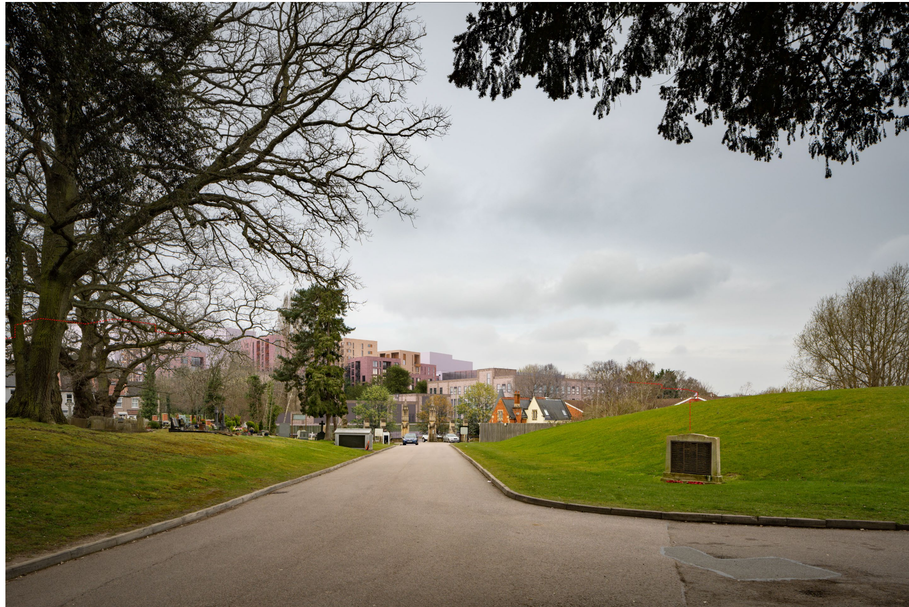
View 7: New Southgate Cemetery, looking towards entrance gateway