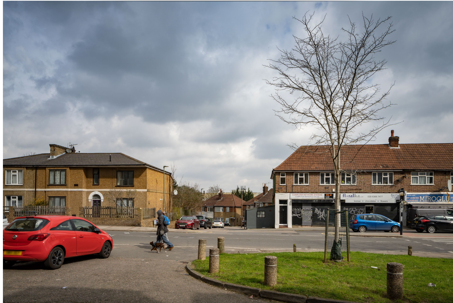
View 18: Oakleigh Road north, looking along Oakleigh Crescent