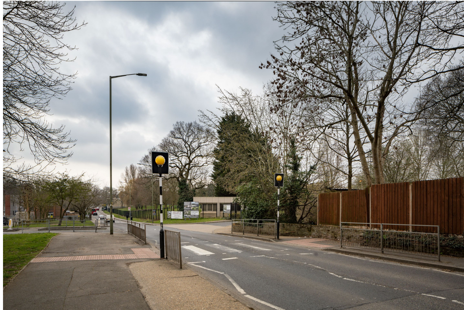
View 10: Brunswick Park Road north