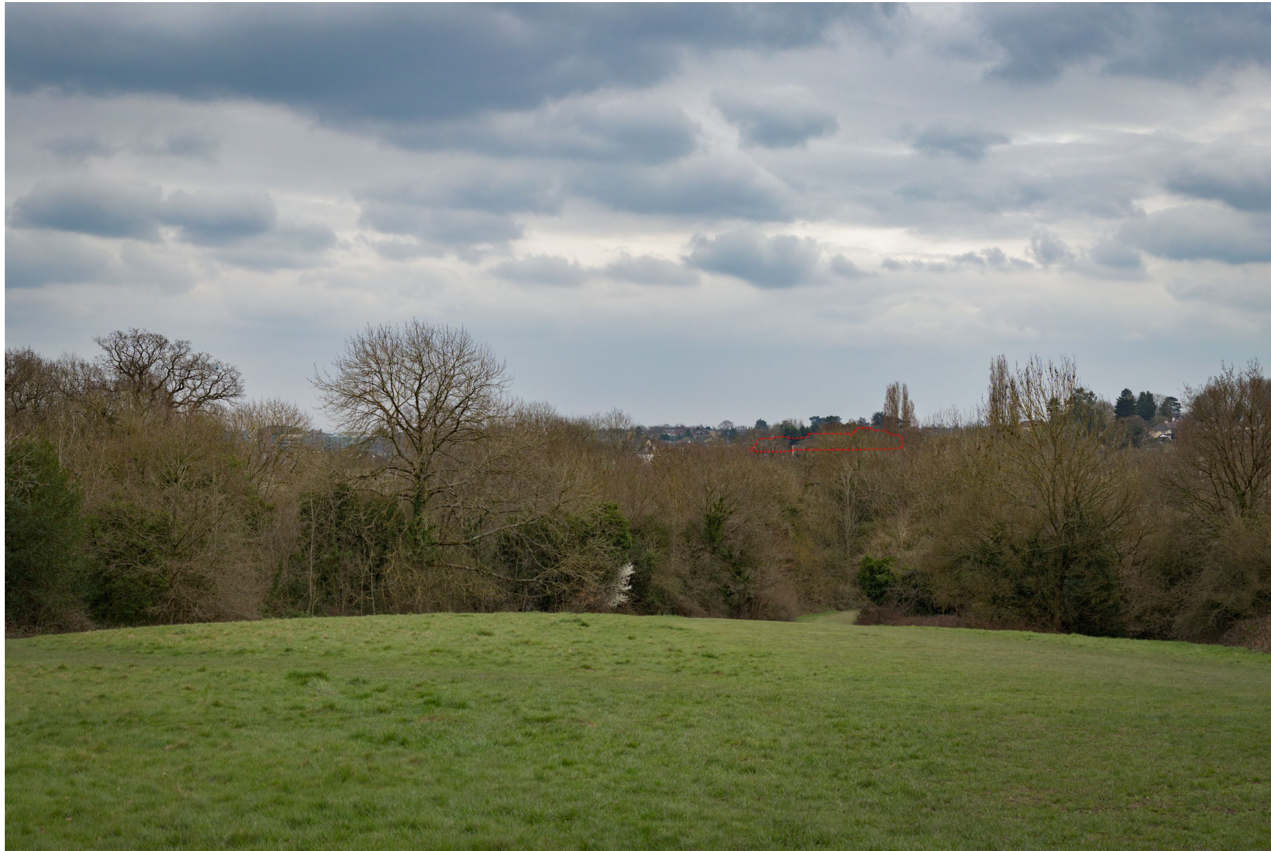
View 1: King George's Playing Fields, Hadley Green