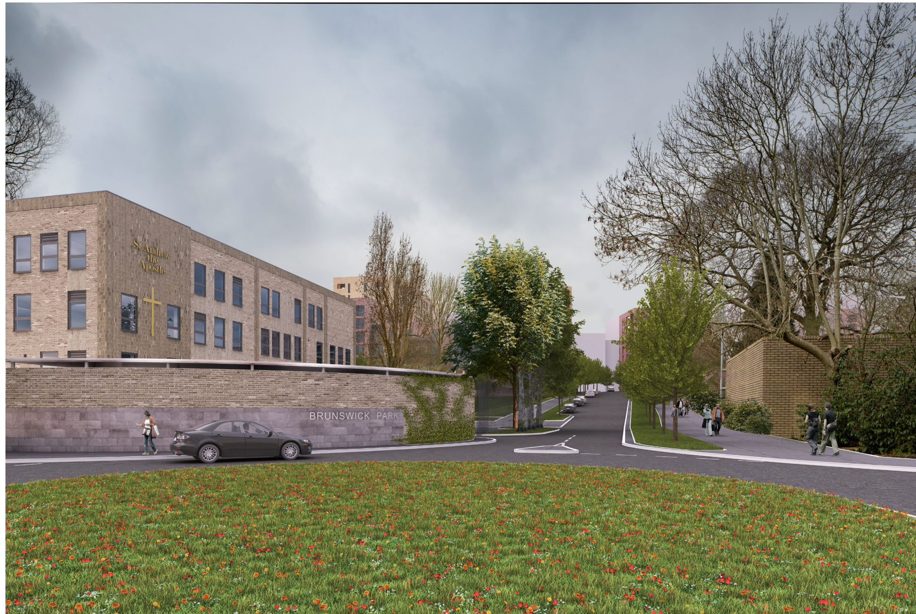
View 9: Brunswick Park Road, looking along site entrance