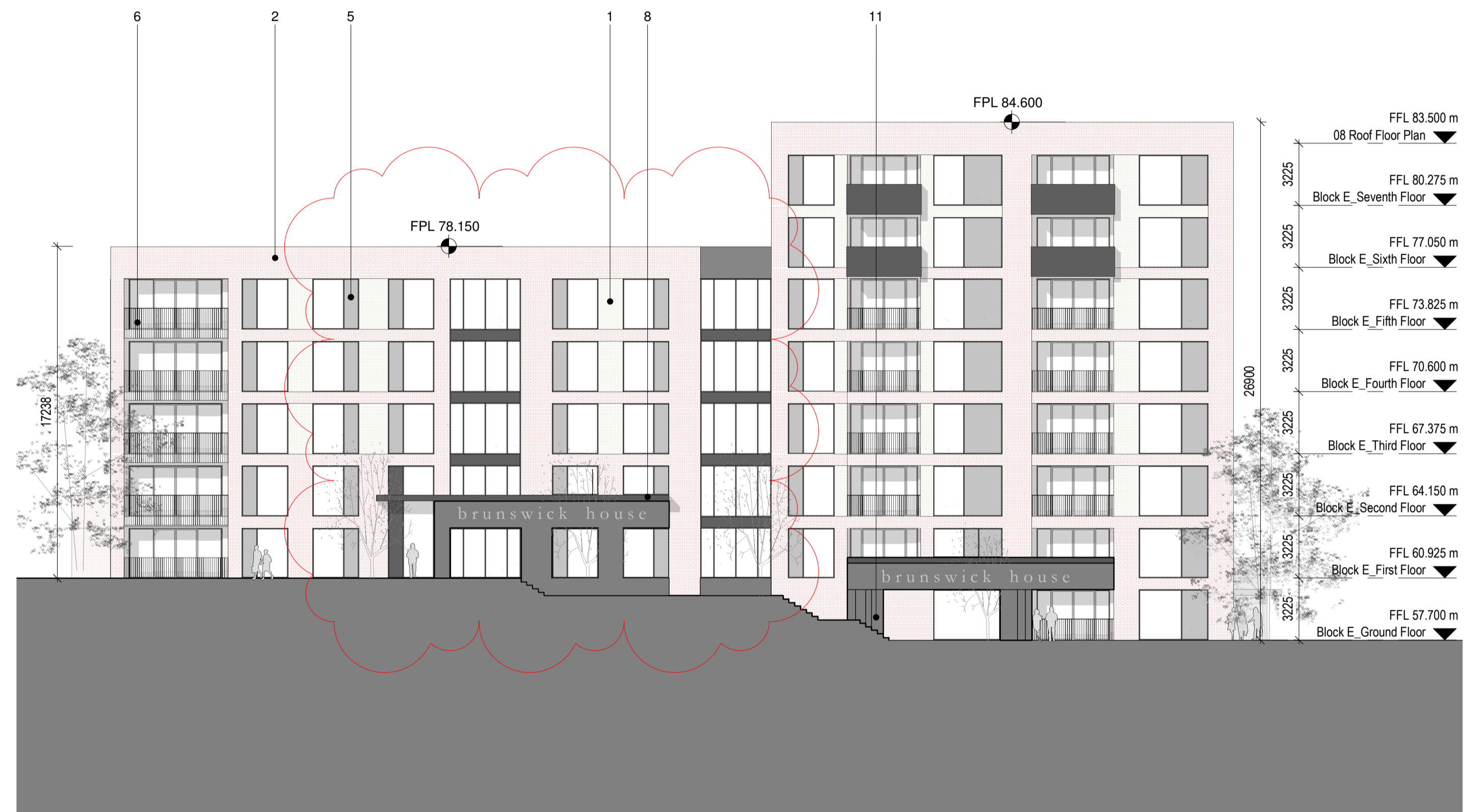
1 Block 1F_South Elevation 1 : 200