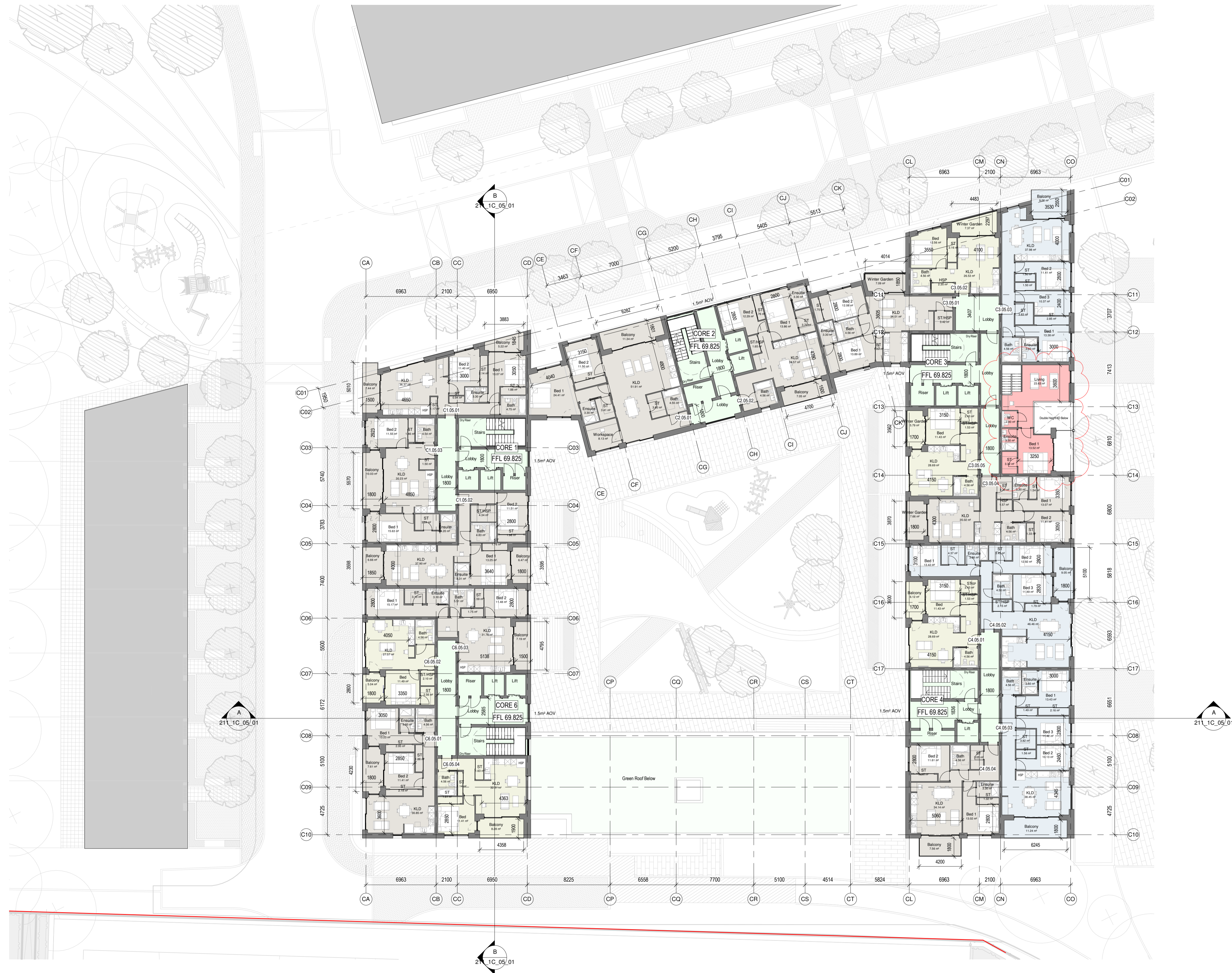
1 Block 1C_Fifth Floor Plan 1 : 200