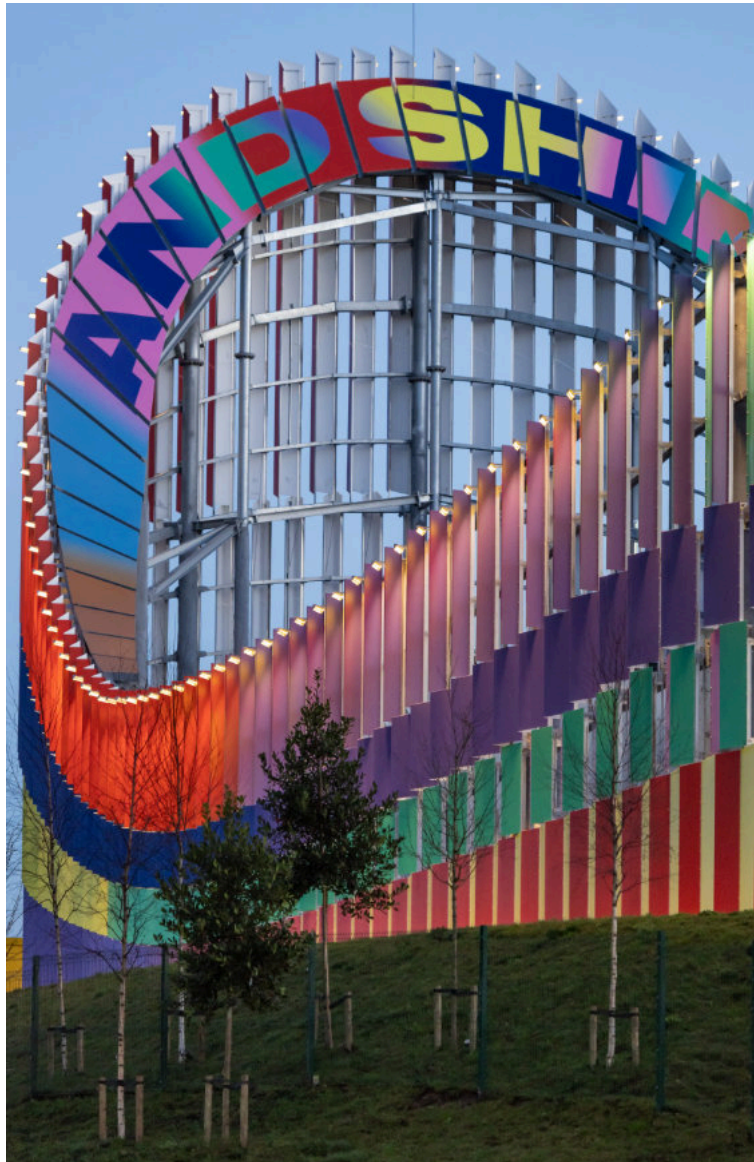
Brent Cross Substation, IF_DO