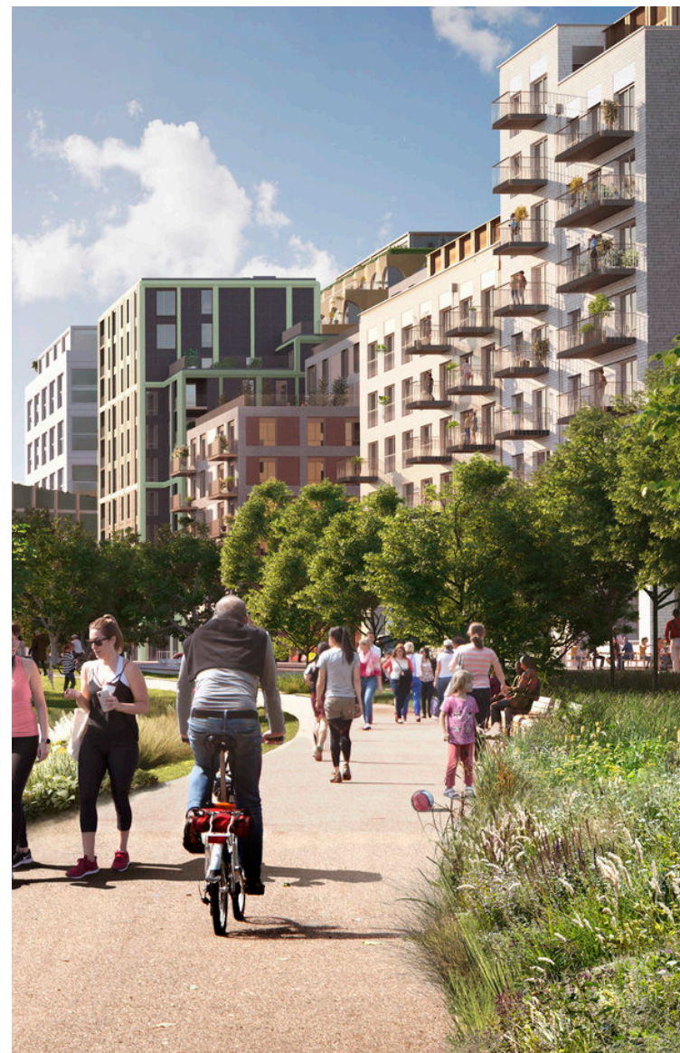
Brent Cross Town © Allies & Morrison