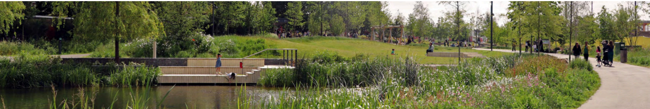
Claremont Park, Townshend Landscape Architects © Townshend Landscape Architects

Large projects, for example schemes with several development plots, may be split into smaller elements, to ensure that each component receives adequate time for discussion.