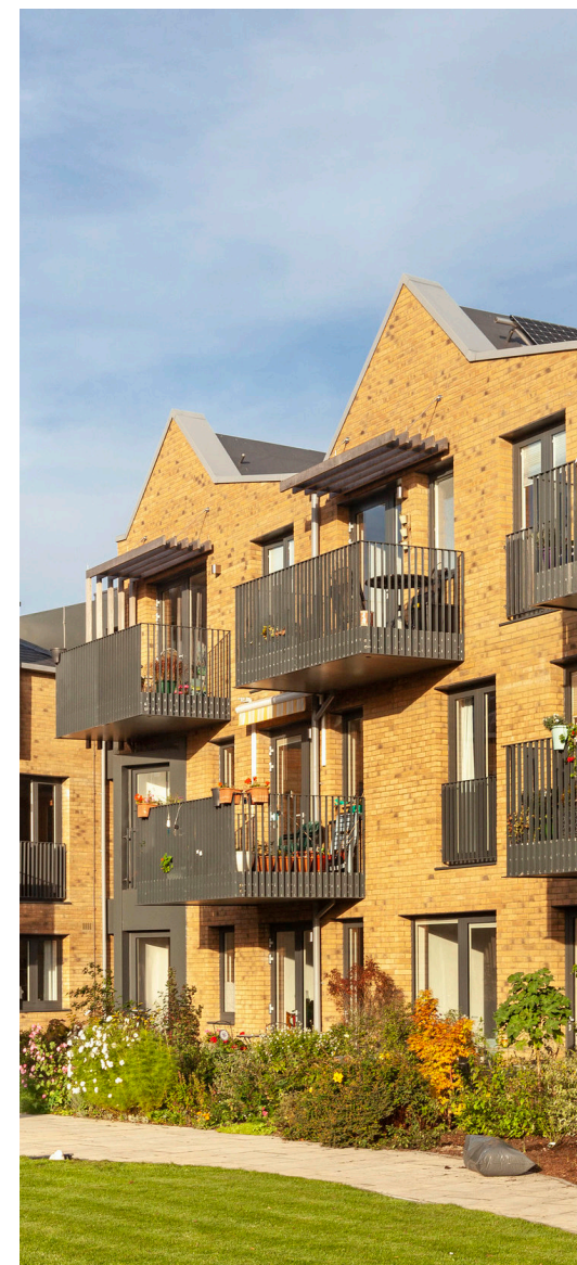
New Ground Cohousing, Pollard Thomas Edwards

Subsequent reviews will be charged for at the applicable rate (detailed in Section 14).