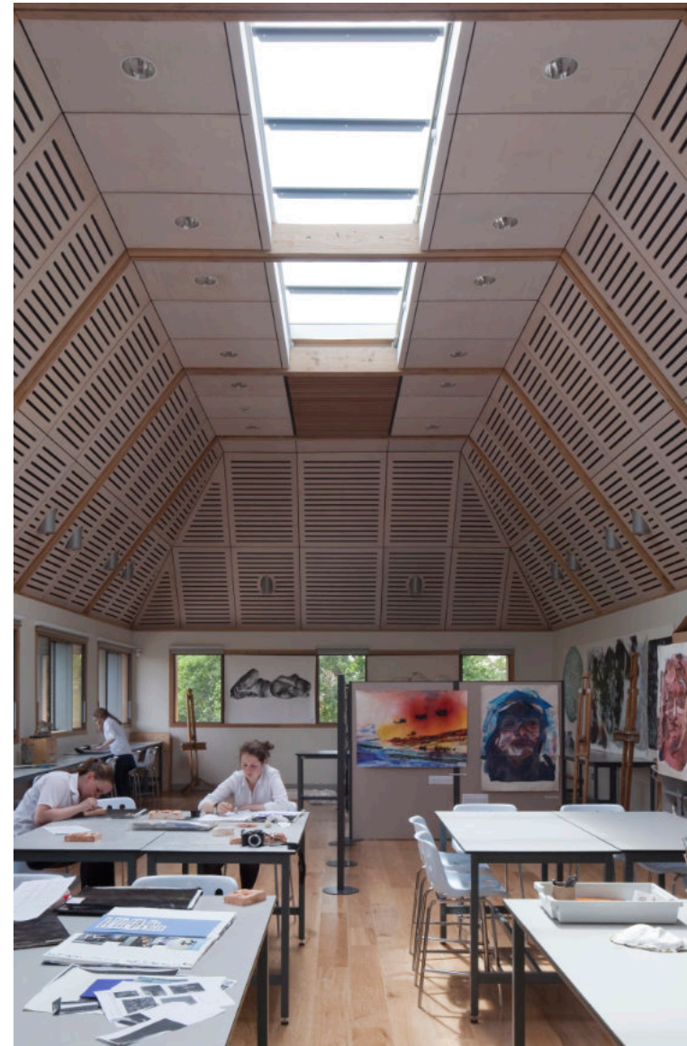
The Henrietta Barnett School, Hopkins Architects

If the proposal is reviewed at an application stage the report will be a public document kept within the proposal's case file and published on Barnet Council's website. Where the final review of a scheme takes place at a pre-application stage, the report of this meeting may also be made public once an application is submitted.