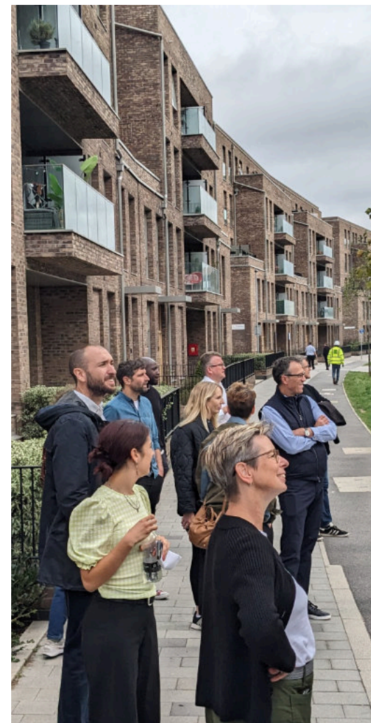
Panel member site visit

By offering advice to applicants during the pre-application process and by commenting on planning applications, the Quality Review Panel supports Barnet's planning officers and planning committee in securing high quality development.