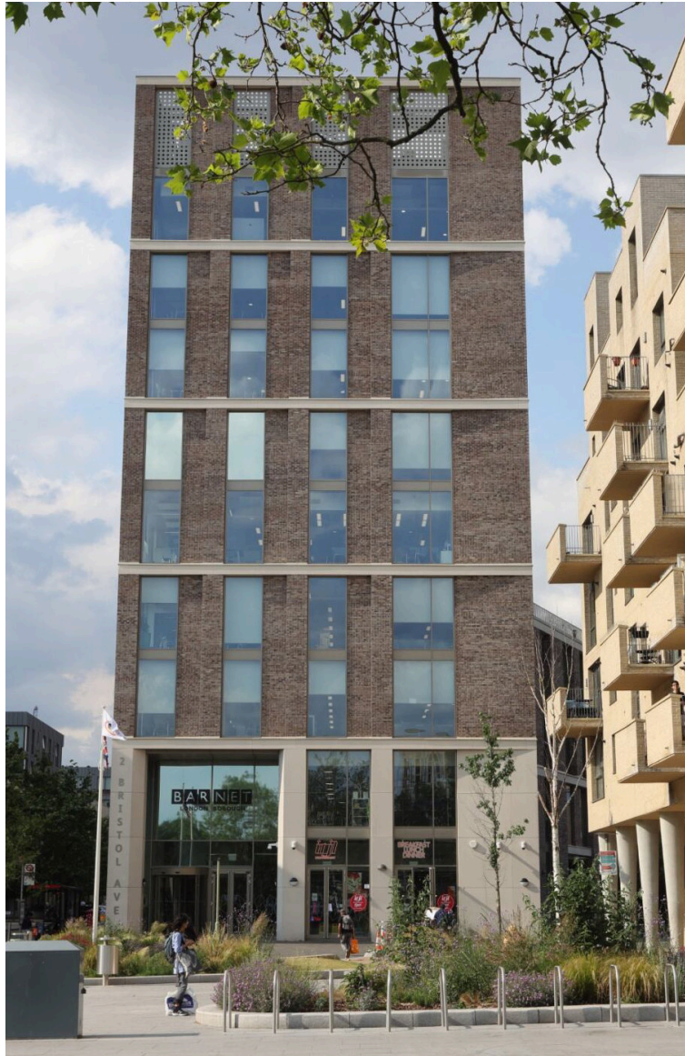
Colindale Offices, HawkinsBrown © Barnet Council