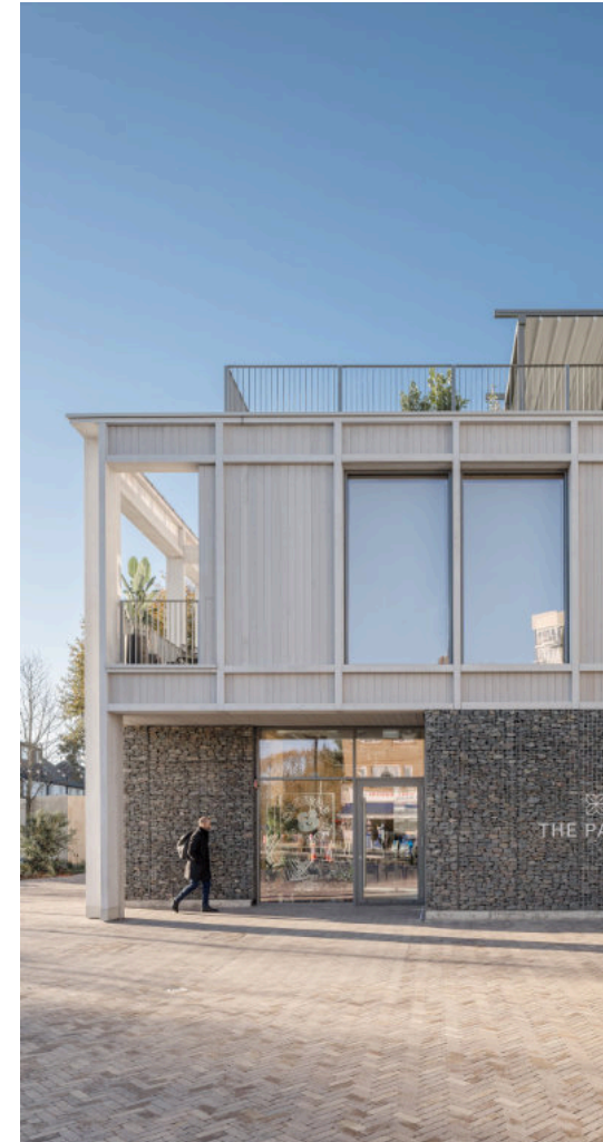
Brent Cross Town Visitor Pavilion, Moxon Architects

www.london.gov.uk/sites/default/files/ggbd_london_design_review_charter_jan22.pdf