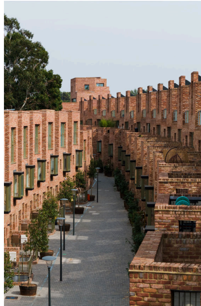
Edgewood Mews, Peter Barber Architects

From time to time, it may be of benefit for specialist advice to be provided beyond the Quality Review Panel membership. In such cases, a professional with the relevant expertise may be invited to attend a review meeting, participating in the discussion with the status of an adviser to the panel.