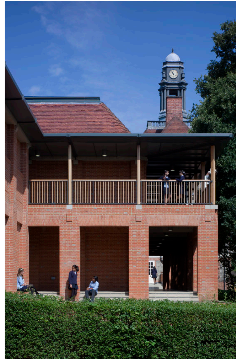
The Henrietta Barnett School, Hopkins Architects

If any points made by the Quality Review Panel require clarification, it is the responsibility of the applicant and their design team to draw this to the attention of the chair of the panel (if during the meeting) or the panel manager, Frame Projects (if the report requires clarification).