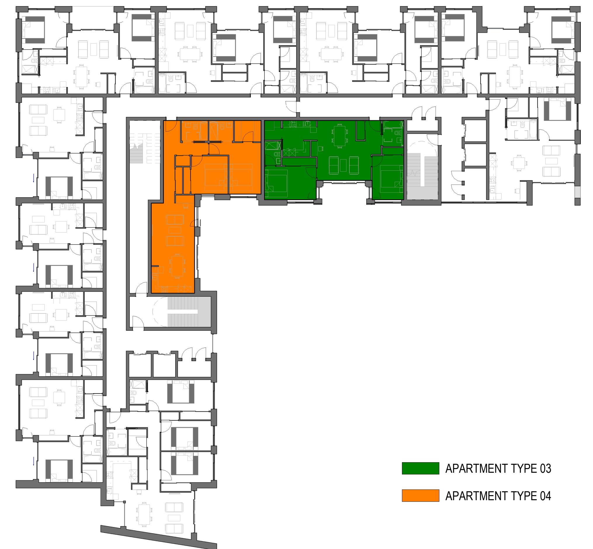
3 Block E_2 Bedroom Apartment Key Plan_Type 03 & 04 1 : 200