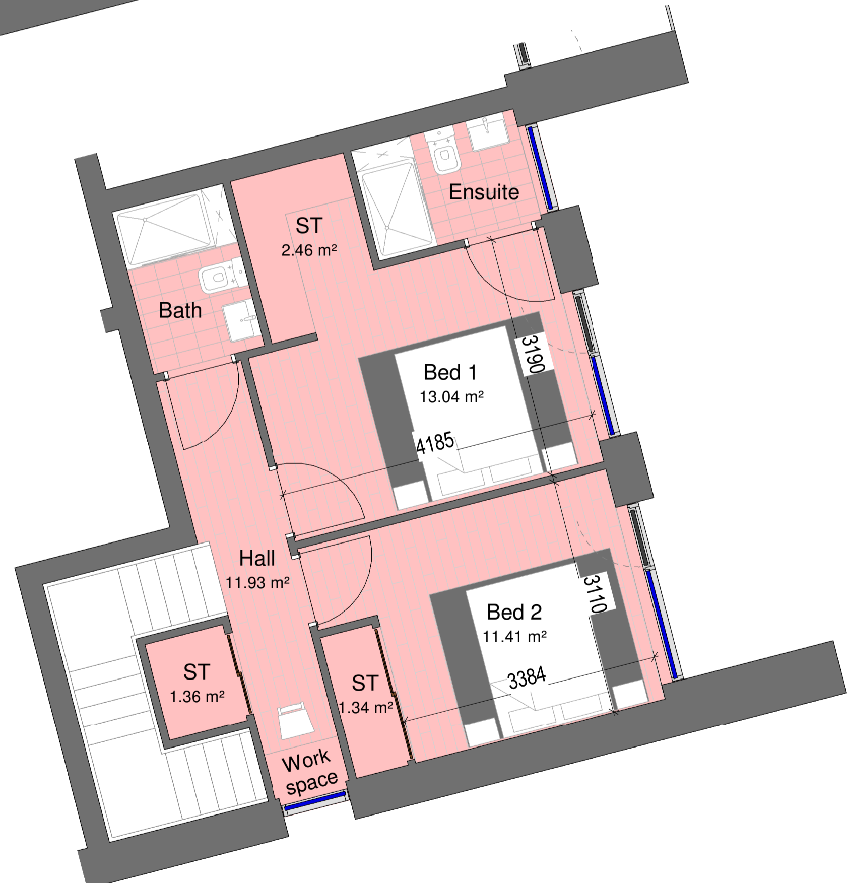
1 Block D_2 Bedroom Duplex Apartment Type 01 1 : 50 Lower Floor Size: 50.9m 2 Upper Floor Size: 50.9m 2 Total Size: 101.8m 2 Total Apartments: 1